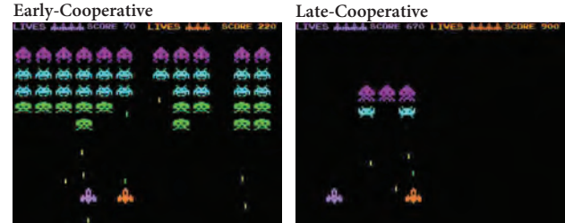
(b) The participants experienced two types of helping behaviors by the co-player (orange ship) in the study.